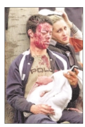
SURVIVORS covers his bleeding wounds.

HORRIFIC peak-hour train bombings in Spain killed at least 173 people and injured