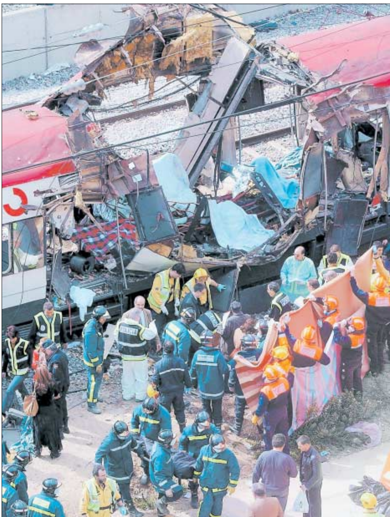
Firefighters remove a body from a bomb-damaged passenger train Thursday after 10 explosions rocked trains and stations in Madrid. The blasts killed nearly 200 people and injured nearly 1,500 others.