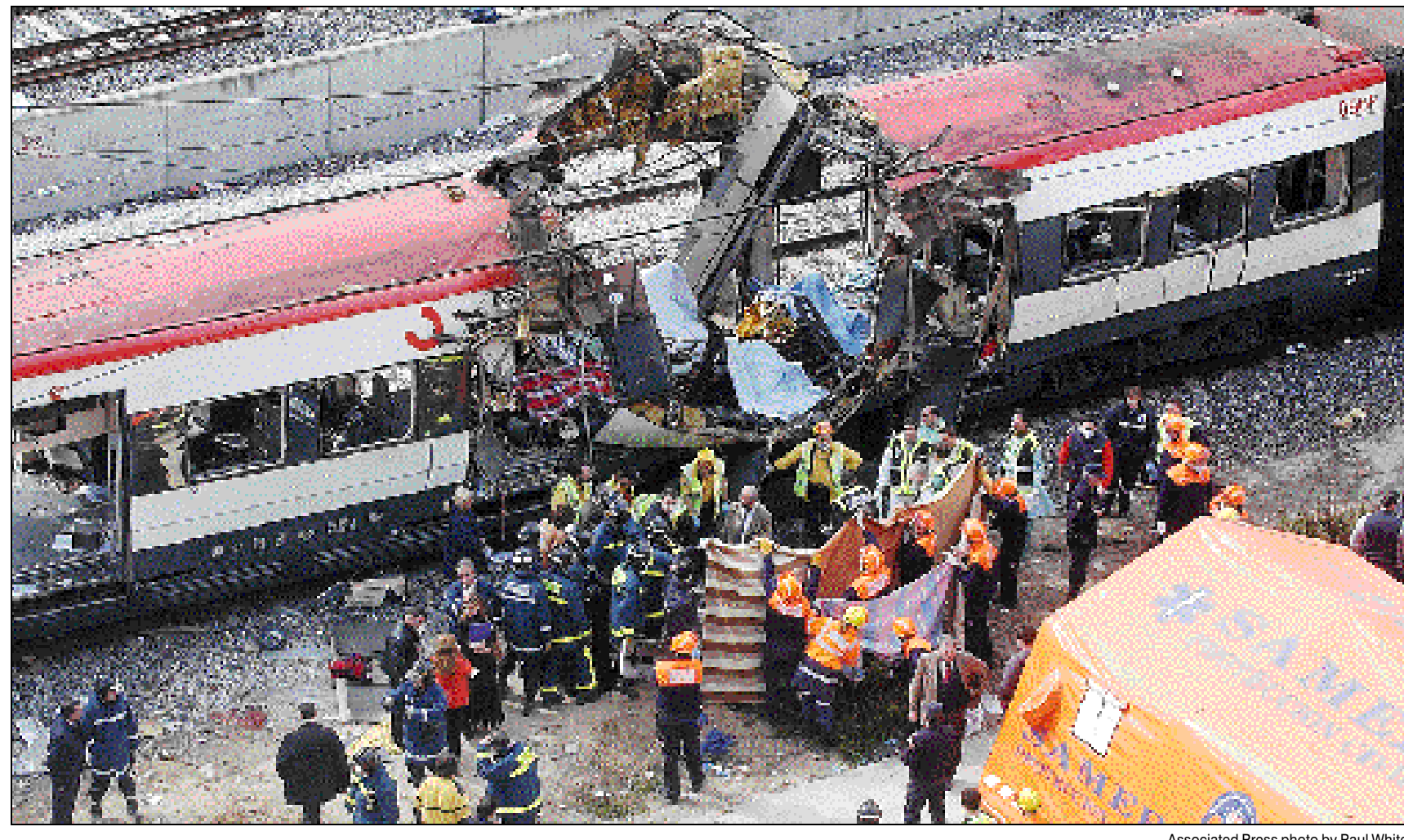
Rescue workers cover bodies by a bomb-damaged passenger train after explosions in Madrid, Spain, on Thursday, three days before Spain's general elections. More than 1,400 were wounded in Spain's worst terrorist attack ever. Below right, an injured man walks outside the Atocha rail station.