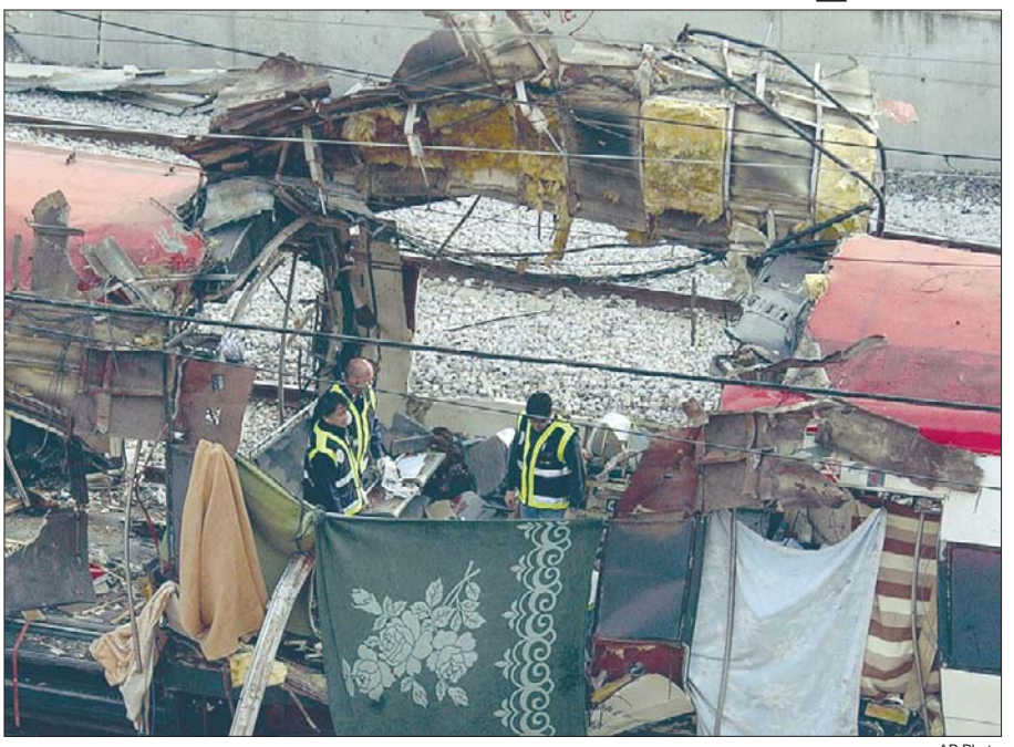
SAD DUTY: Rescue workers work inside a train at the Atocha station following a bomb blast there, after explosions rocked four stations in Madrid, Spain, on Thursday, killing at least 192 and injuring 1,200 people aboard commuter trains. The explosions occurred just three days before Spain's general elections. The government laid the locked at the feet of the ETA, a Basque terror group, but another group took responsibility in the name of al-Qaida