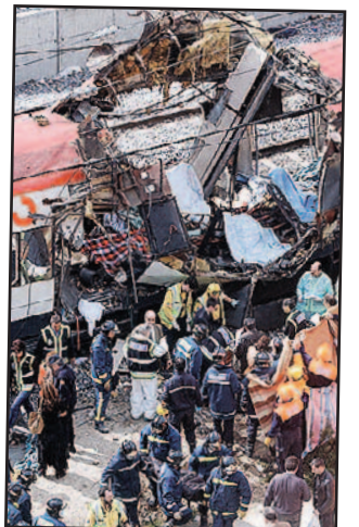
CARNAGE: Train torn apart