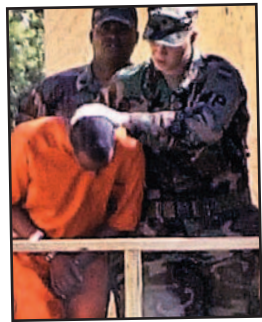
BULLIED: X-ray prisoner