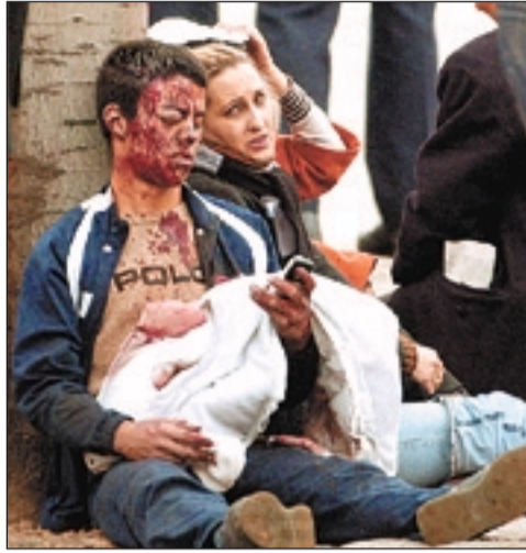
Two people injured in an explosion in a train wait for aid outside the Atocha train station Thursday in Madrid, Spain.

Europe's worst terrorist attack since 1988 kills 192, injures at least 1,400 as 10 bombs shred Madrid train line