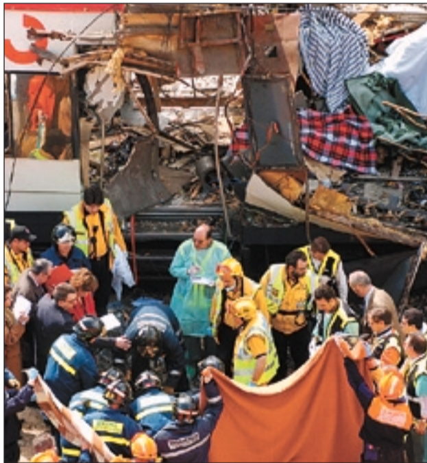
Police carry bodies out of a passenger train Thursday in the Atocha train station in Madrid, Spain.